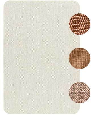
TE VANILLA 1