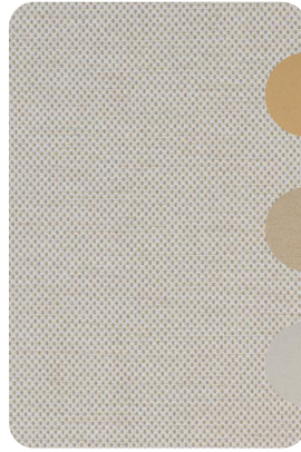
TE TOSCANA 1